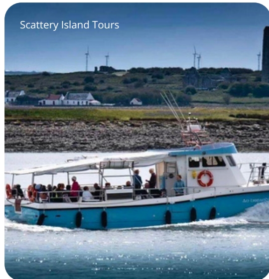
Scattery Island Tours