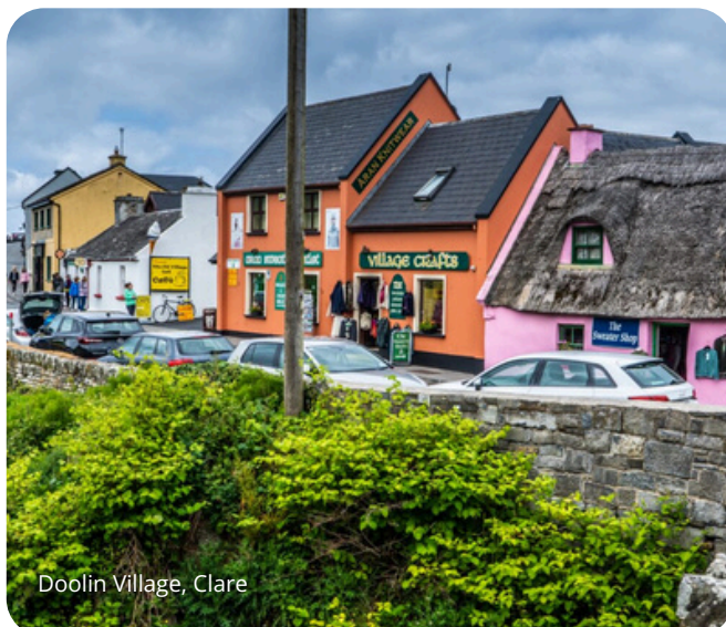
Doolin Village, Clare