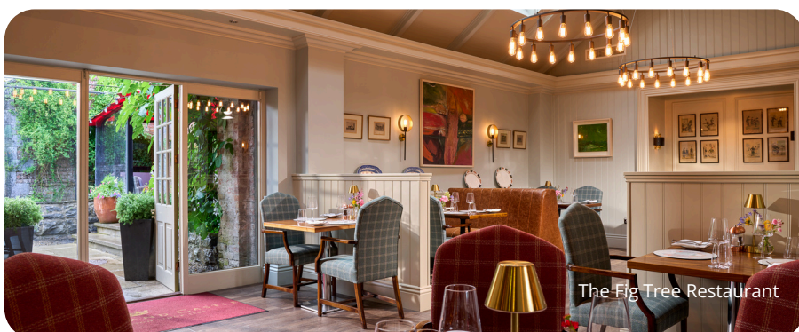
The Fig Tree Restaurant

IRISH COUNTRY LIVING: Wonderfully situated on Dromoland Castle Estate, our guest have access to the five star grounds and amenities of our sister property. Fancy a relaxing treatment? Book in at The Castle Spa during your stay. Explore more culinary options at our sister properties restaurant; The Fig Tree (a 15 minute walk, 2 minute drive) backing onto the beautiful Walled Gardens.