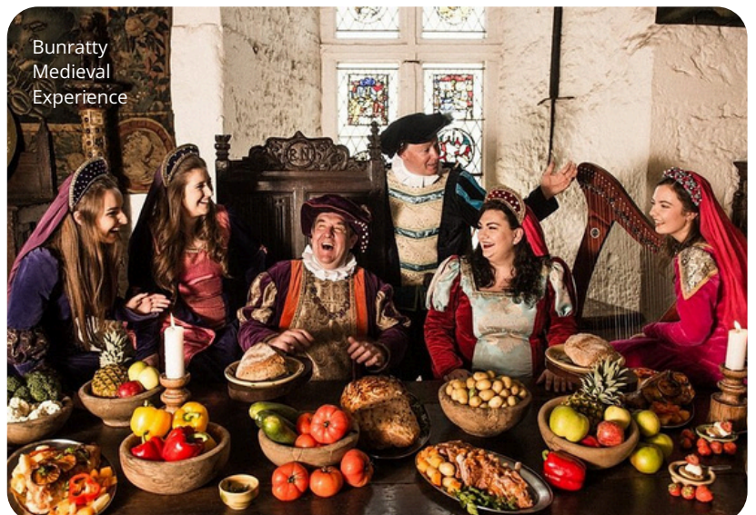
Bunratty Medieval Experience