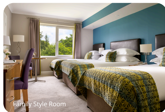
Family Style Room

EXPLORE OUR IN-HOUSE DINING At our Shannigan's Gastro Pub, we prioritize ethically sourced, sustainable Irish produce, valuing our relationships with suppliers as much as our customers. We believe great food brings joy, especially when made with fresh, local ingredients. Our menus celebrate seasonality, blending tradition with creativity, while daily specials highlight our commitment to fresh, flavourful cooking.