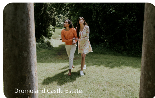
Dromoland Castle Estate

EXPLORE OUR 500 ACRE ESTATE After travel, take a day to unwind & relax with the family around our beautiful countryside estate