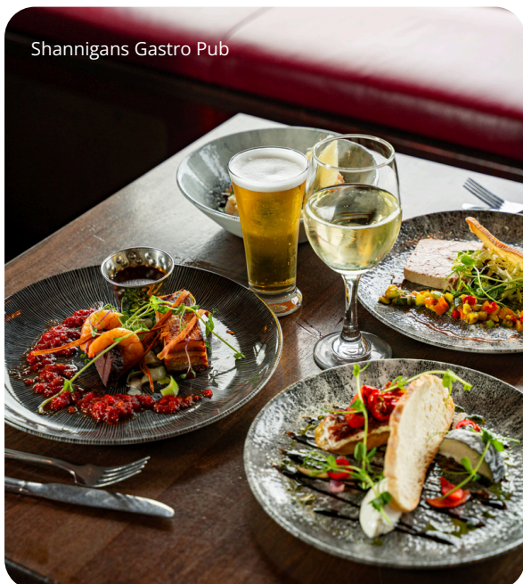
Shannigans Gastro Pub