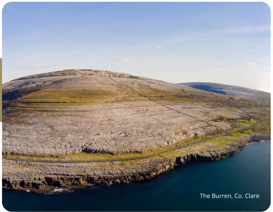
The Burren, Co. Clare

Then on the way home make a night of entertainment and food at Bunratty Castle's Medieval Banquet (only a 10 minute drive from The Inn at Dromoland!)